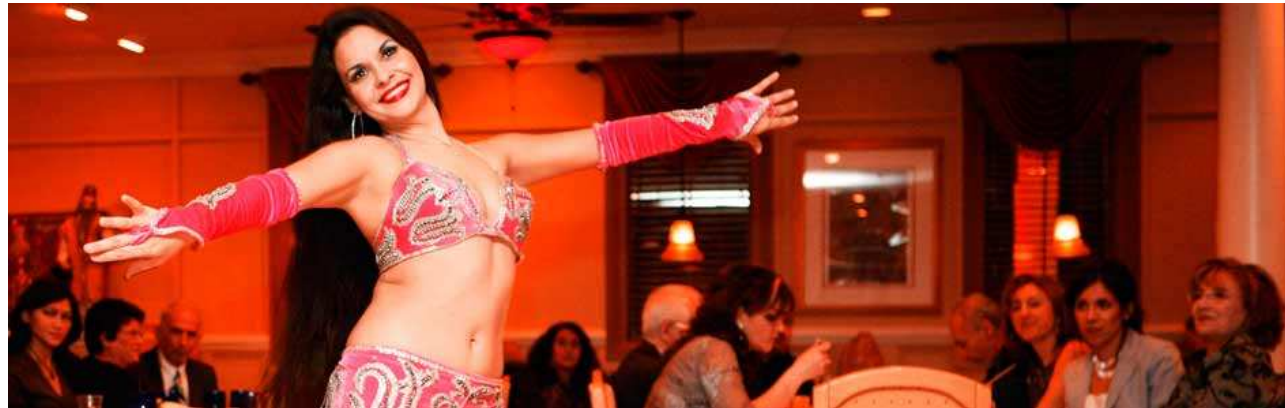
Raks Sharqi dancer at Pars Restaurant - Farmington Hills

Home Features Videos Blogs Cities Innovation & Job News Development News In the News Growth Companies FilterD